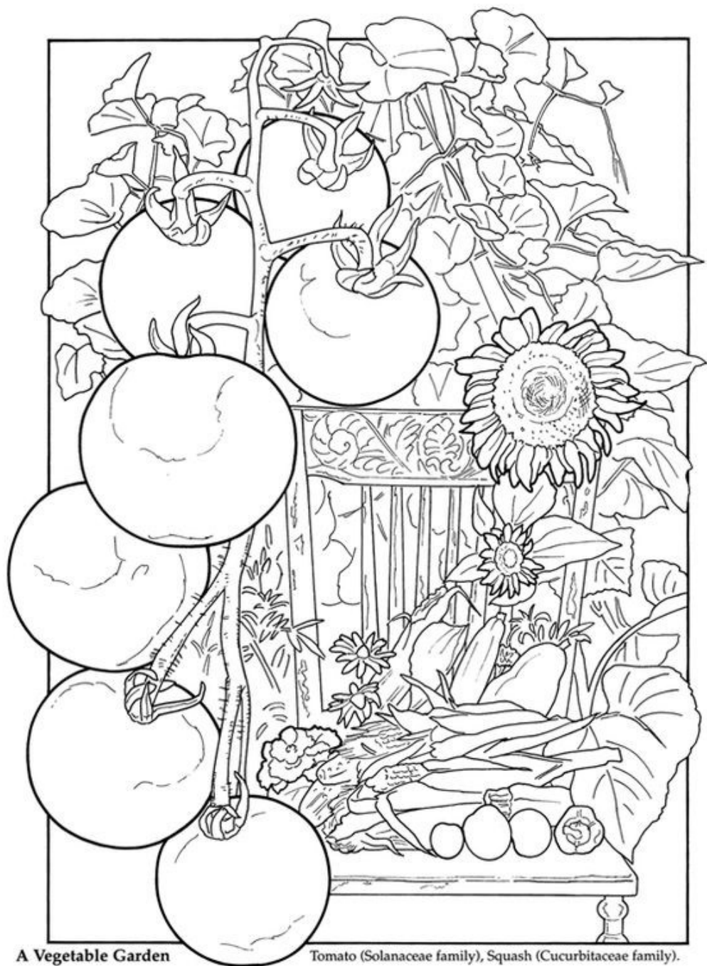
A Vegetable Garden

Tomato ( Solanaceae family), Squash ( Cucurbitaceae family).